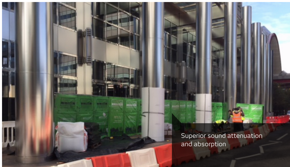
Superior sound attenuation and absorption

RVT was engaged by stonework specialists M&S Restorations, to provide noise control measures to recent stone and tarmac cutting works. The unavoidable production of intense noise levels would pose a health hazard to those working, shopping and enjoying the leisure facilities at the complex. M&S Restorations needed a powerful and practical solution that could be rapidly deployed on site.