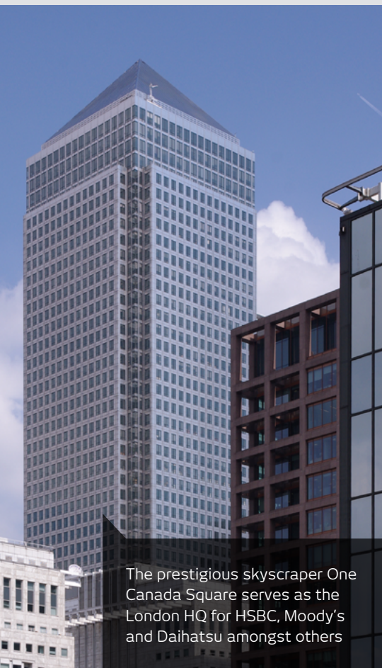
The prestigious skyscraper One Canada Square serves as the London HQ for HSBC, Moody's and Daihatsu amongst others

Designed by Pelli Clarke Pelli, the towering skyscraper set the benchmark for innovative high-rise design technology with 32 high-speed passenger lifts serving the 1.2 million square-foot building. One Canada Square's pyramid roof, containing a flashing aircraft warning light, has become iconic in itself after appearing multiple times on television and in films, including James Bond: World is Not Enough, Harry Potter and the Order of the Phoenix and The Bourne Supremacy.