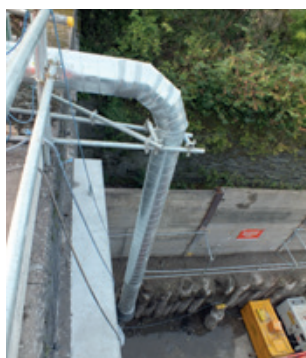
The system used an 800mm duct.

The 1838 tunnel was to be filled with 7,500m 3 of specially formulated foam concrete and then re-bored using the UK's largest tunnel boring machine, 'Fillie', which took 12 weeks. Despite initial ground investigations, sand unexpectedly poured into the excavated area on two occasions, and 100,000 tonnes of material had to be removed by hand. As a result, the TBM broke through on 25 October 2015, 21 days later than planned. However, the new tunnel still opened on schedule, on 14 December 2015.