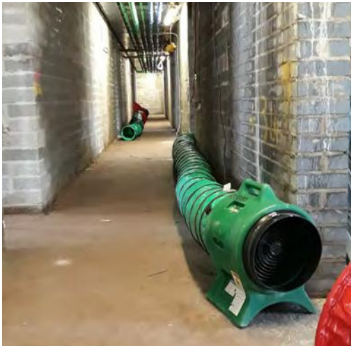
CLIMEX® Air Distribution Kit