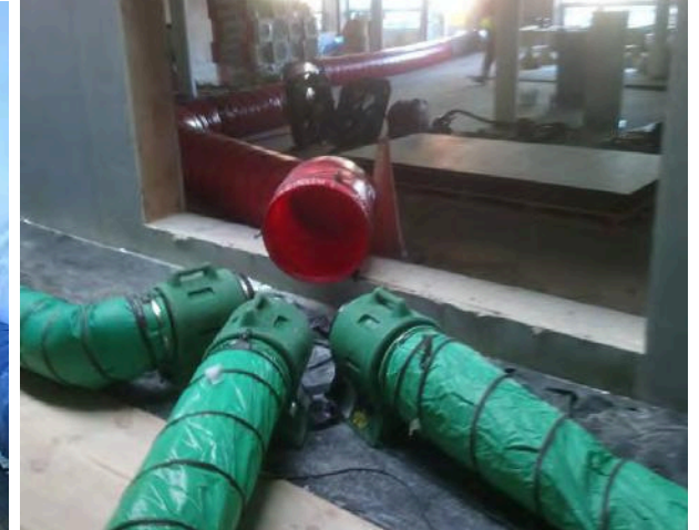
The indirect oil fired heater forces warm air along the ducting, into the sealed building, where it can be evenly distributed using air distribution kits.